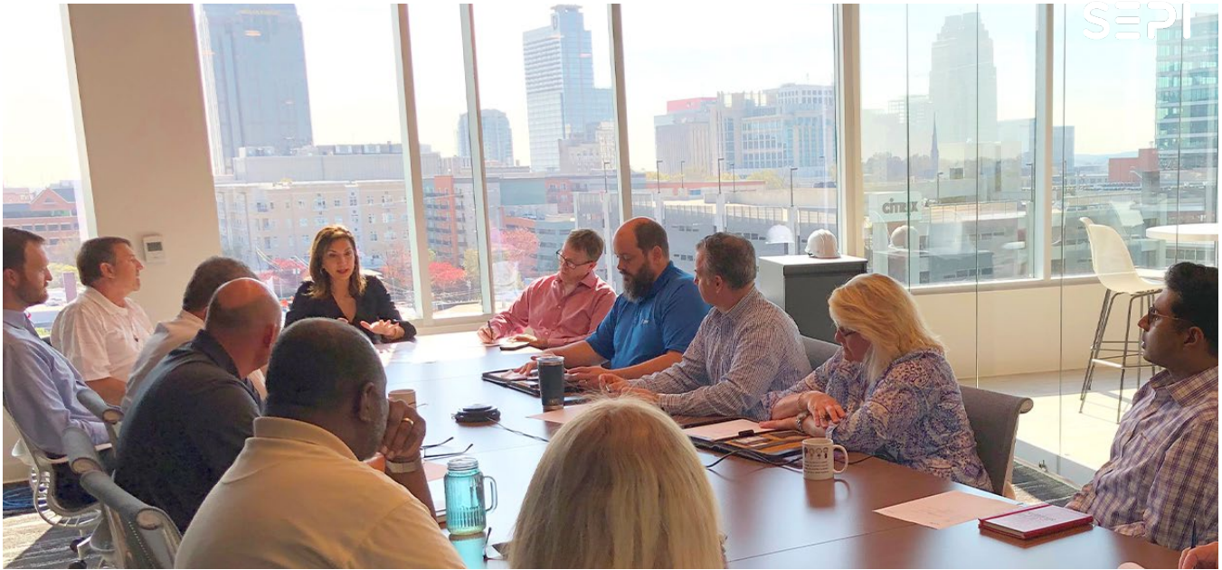
SEPI corporate headquarters in downtown Raleigh, NC.